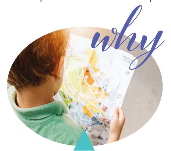
Traits, drivers and derailers provide insights into root causes of demonstrated behaviors

Provides a holistic view of a leader and gives deep insights to attract, identify and create personalized development plans using hard data