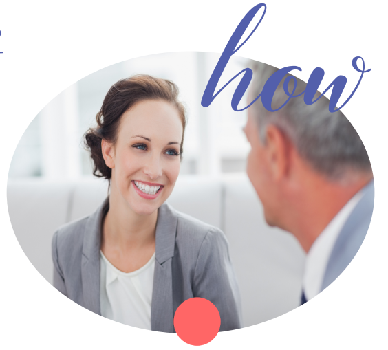
A personalized feedback session provides focus and development tips