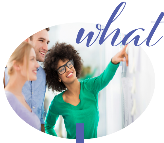
Human Performance & competencies show observed behaviors